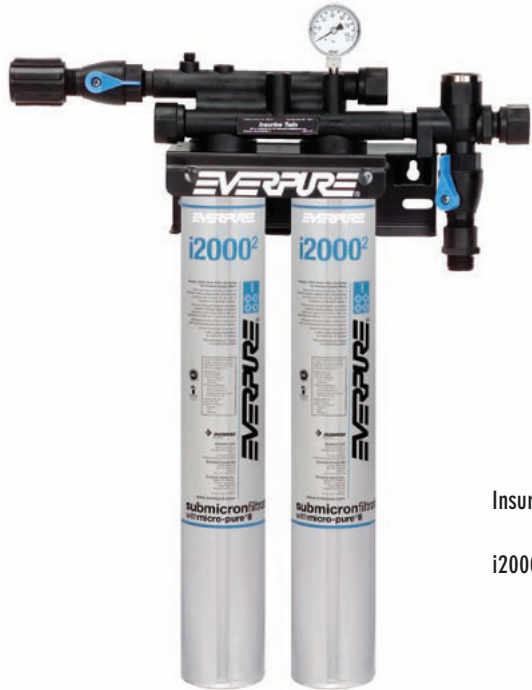
Insurice Twin-i2000 2 System: EV9324-02

Delivers premium quality water for ice applications