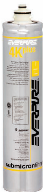
4K-Plus Replacement Cartridge: EV9612-71

Delivers premium quality water for foodservice, vending and OCS applications