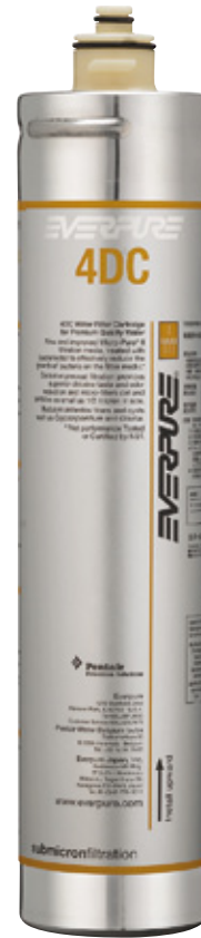
4DC Replacement Cartridge: EV9591-46

Everpure water treatment systems are covered by a limited warranty against defects in material and workmanship for a period of one year after date of purchase. Everpure replaceable elements (filter cartridges and water treatment cartridges) are covered by a limited warranty against defects in material and workmanship for a period of one year after date of purchase. See printed warranty for details. Everpure will provide a copy of the warranty upon request.