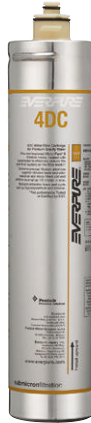
4DC Replacement Cartridge: EV9591-46

Everpure water treatment systems are covered by a limited warranty against defects in material and workmanship for a period of one year after date of purchase. Everpure replaceable elements (filter cartridges and water treatment cartridges) are covered by a limited warranty against defects in material and workmanship for a period of one year after date of purchase. See printed warranty for details. Everpure will provide a copy of the warranty upon request.