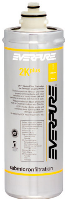
2K-Plus Replacement Cartridge: EV9612-61

Delivers premium quality water for foodservice, vending and OCS applications