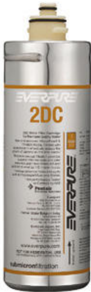
2DC Replacement Cartridge: EV9591-06

Everpure water treatment systems are covered by a limited warranty against defects in material and workmanship for a period of one year after date of purchase. Everpure replaceable elements (filter cartridges and water treatment cartridges) are covered by a limited warranty against defects in material and workmanship for a period of one year after date of purchase. See printed warranty for details. Everpure will provide a copy of the warranty upon request.