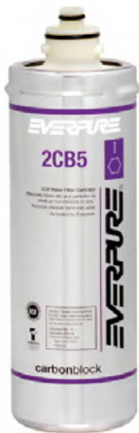
2CB5 Replacement Cartridge: EV9617-05

Delivers quality water for foodservice, vending and OCS applications