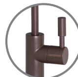
Oil Rubbed Bronze