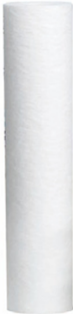
EC110 Prefilter Cartridge: EV9534-12