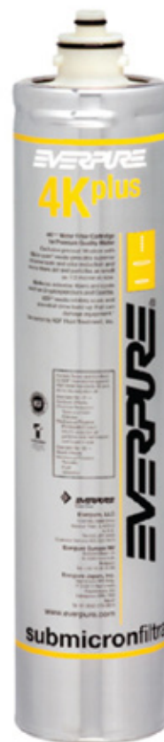
4K-Plus Replacement Cartridge: EV9612-71

Everpure water treatment systems (excluding replaceable elements) are covered by a limited warranty against defects in material and workmanship for a period of five years after date of purchase. Everpure replaceable elements (filter cartridges and water treatment cartridges) are covered by a limited warranty against defects in material and workmanship for a period of one year after date of purchase. See printed warranty for details. Everpure will provide a copy of the warranty upon request.