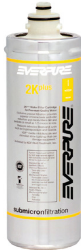
2K-Plus Replacement Cartridge: EV9612-61

Everpure water treatment systems (excluding replaceable elements) are covered by a limited warranty against defects in material and workmanship for a period of five years after date of purchase. Everpure replaceable elements (filter cartridges and water treatment cartridges) are covered by a limited warranty against defects in material and workmanship for a period of one year after date of purchase. See printed warranty for details. Everpure will provide a copy of the warranty upon request.